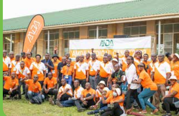
AMDA Caravan to Ibanda

Archdiocese of Mbarara Development Association (AMDA)