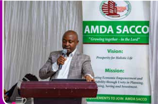
AMDA SACCO holds AGM

Archdiocese of Mbarara Development Association (AMDA)